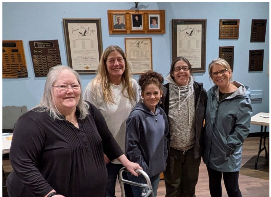
Our newest Auxiliary Members.